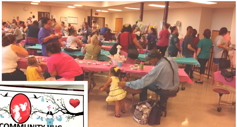
COMMUNITY BABY SHOWER