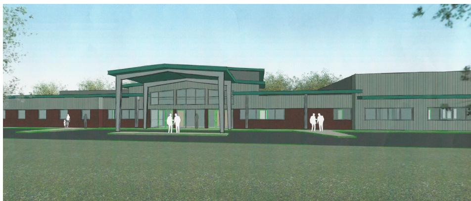
A VISION OF THE FUTURE